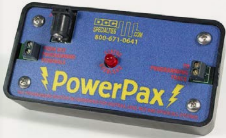
Figure 4: Programming track boosters from SoundTraxx (above) and DCC Specialties (below).

Different manufacturers' decoders prefer different service modes and your DCC system may ask you to choose one of these modes.